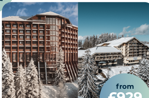
4* ORLOVETZ + PERELIK BED & BREAKFAST