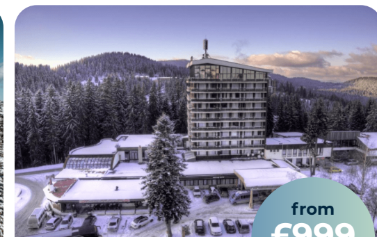
4* MURGAVETS HOTEL BED & BREAKFAST