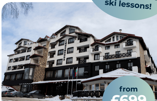
3* SNEZHANKA APTS SELF CATERING